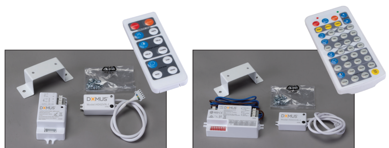
Internal ON/Off Sensor